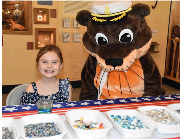
Skipper and friend make their own ocean in a jar during the Museum's 35th birthday party!