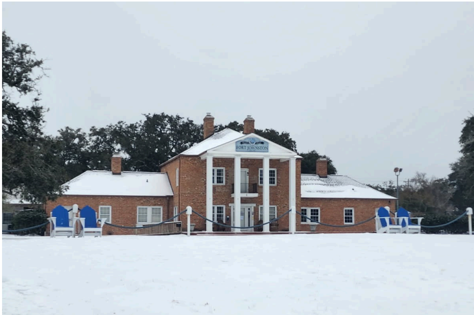
Snow falls on Ft. Johnston

A Belated Happy New Year, shipmates! I hope that you all enjoyed a blessed and safe Holiday season! 2025 – wow; I don't know how you feel but I find it hard to believe that we've started a new year.